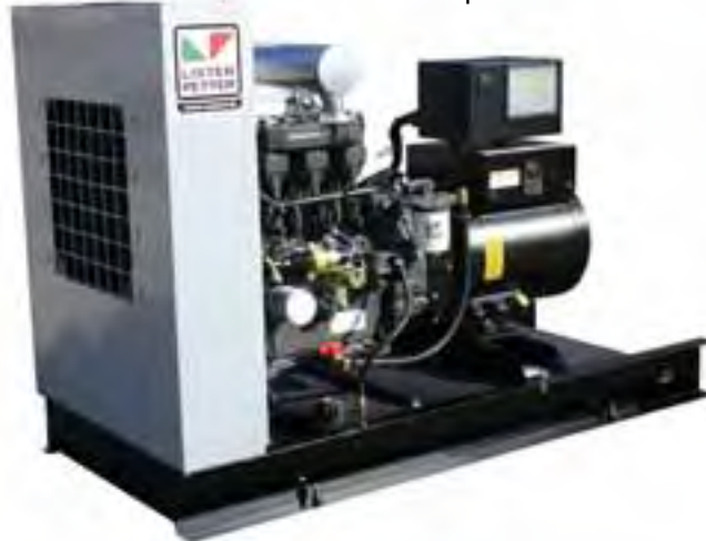
GS Series Open Set Shown

The set illustrated is not necessarily the standard build.