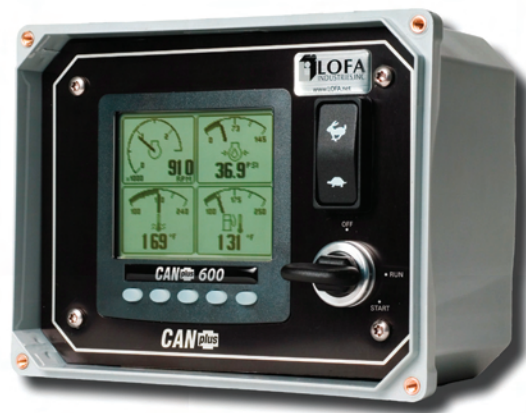
Pictured Above: CP600

The standard panel terminates to a sealed Deutsch weatherproof plug. This connector offers a robust connection that performs well in harsh environments and allows for simplified installation. The design allows installing custom plug-and-play engine wiring harnesses as well as standard harness extensions.