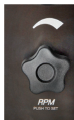
Pictured Above: Rotary digital throttle with push-to-set speed selector allows for changes to Auto-start Operate RPM within pre-defined operational limits