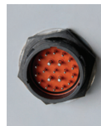
Pictured Above: Deutsch 21 pin engine harness connector